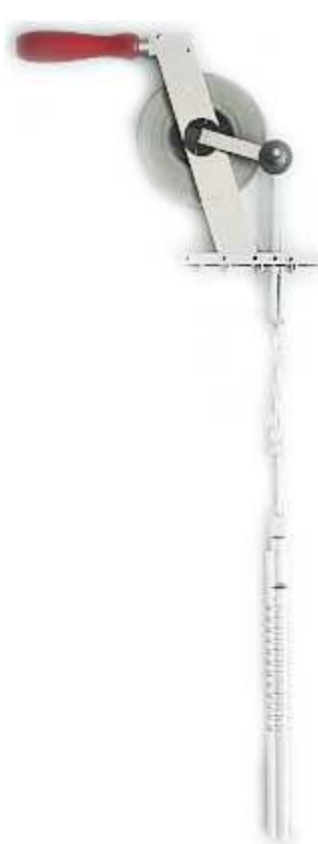
Measuring Set Complete