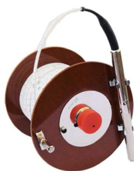
Water Level Meter on hand reel (up to 50m)

The high-precision-measuring-tapes are available with cm/mm markings or feet and 1/100th foot markings.