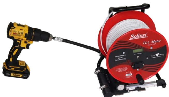
Solinst TLC Meter with Power Winder Installed to Make Temperature and Conductivity Profiling Applications Easier