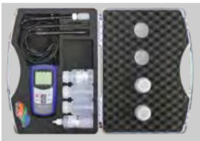
Inlay GKK 5001

Device case soft cut-outs e.g. 2x GMH 3000 or 5000, 395 x 295 x 106 mm (W x H x D)